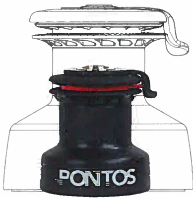
SIZE 28, POWER OF A 45

The Compact winch offers both extra power and speed because of its improved two-gear mechanism. First gear on the Compact sheets in line twice as fast as a conventional two-speed winch; reversing the direction on the winch handle drops it into second gear, which delivers the